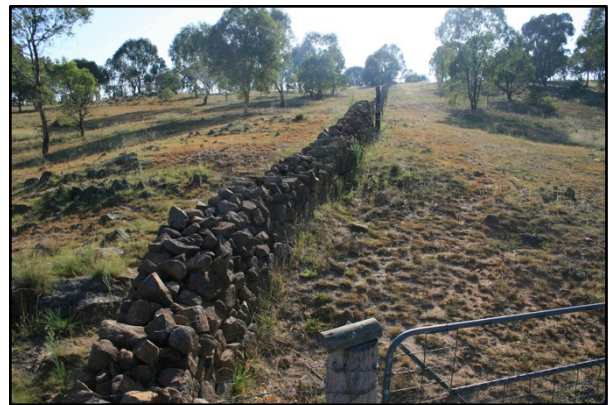
Tuggeranong dry stone wall - heritage in concept area

Government has advised no more investigations will take place until it considers community responses and decides to proceed with urban development.